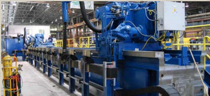
300 TON HOT STRETCH STRAIGHTENER FOUNDATION

E NGINEER to applicable codes and approved best practices P ROCURER system components and equipment I NSTALL system components and equipment C USTOM designs to meet the specific needs of the application